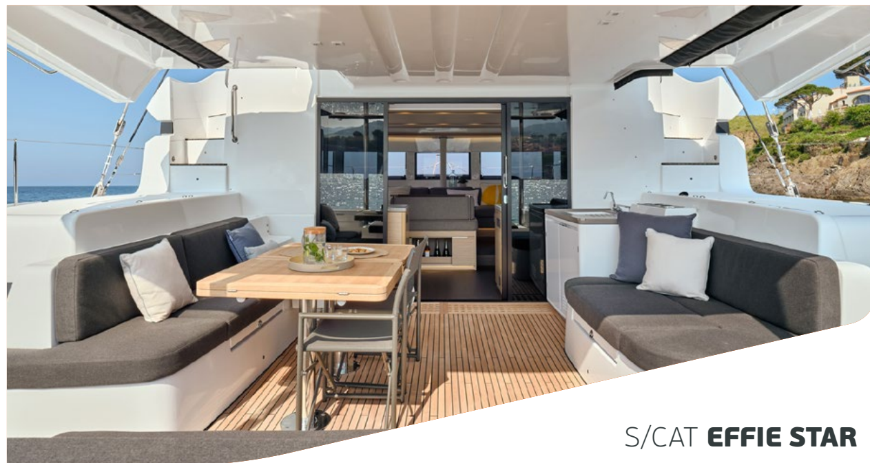
S/CAT EFFIE STAR