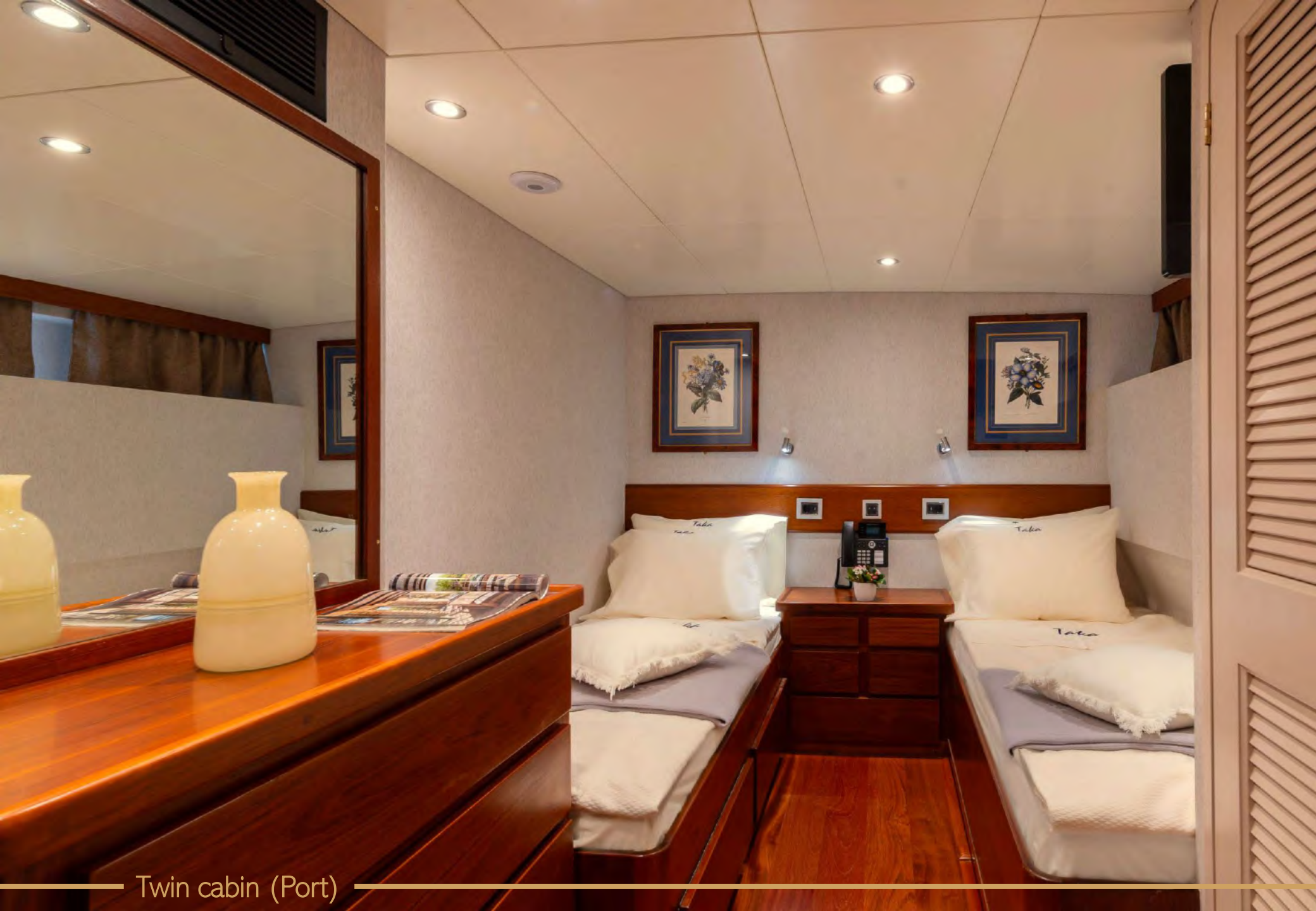
Twin cabin (Port)