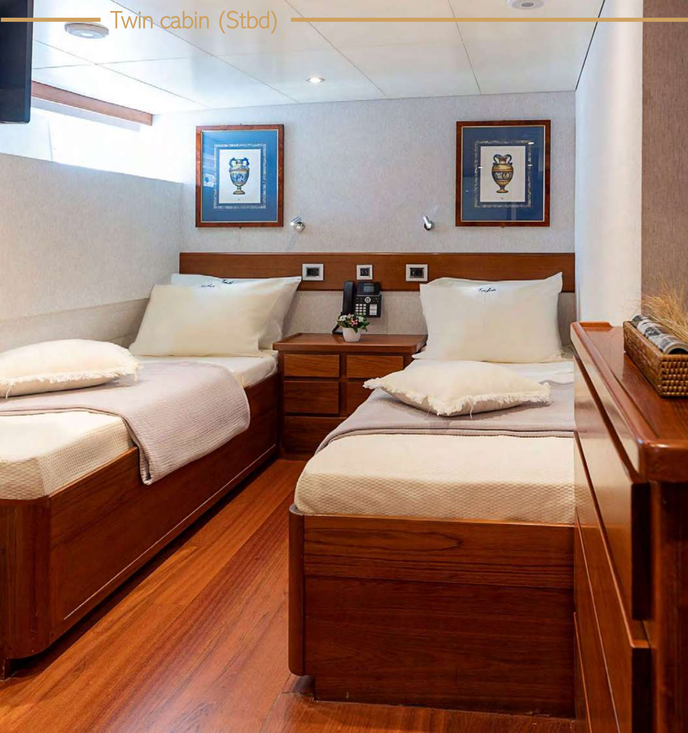
Twin cabin (Stbd)